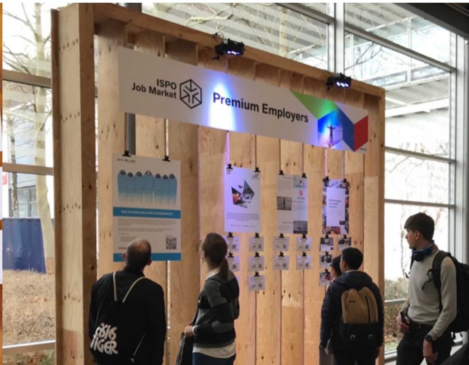
PREMIUM EMPLOYER WALL featuring a company profile and up to 6 job postings