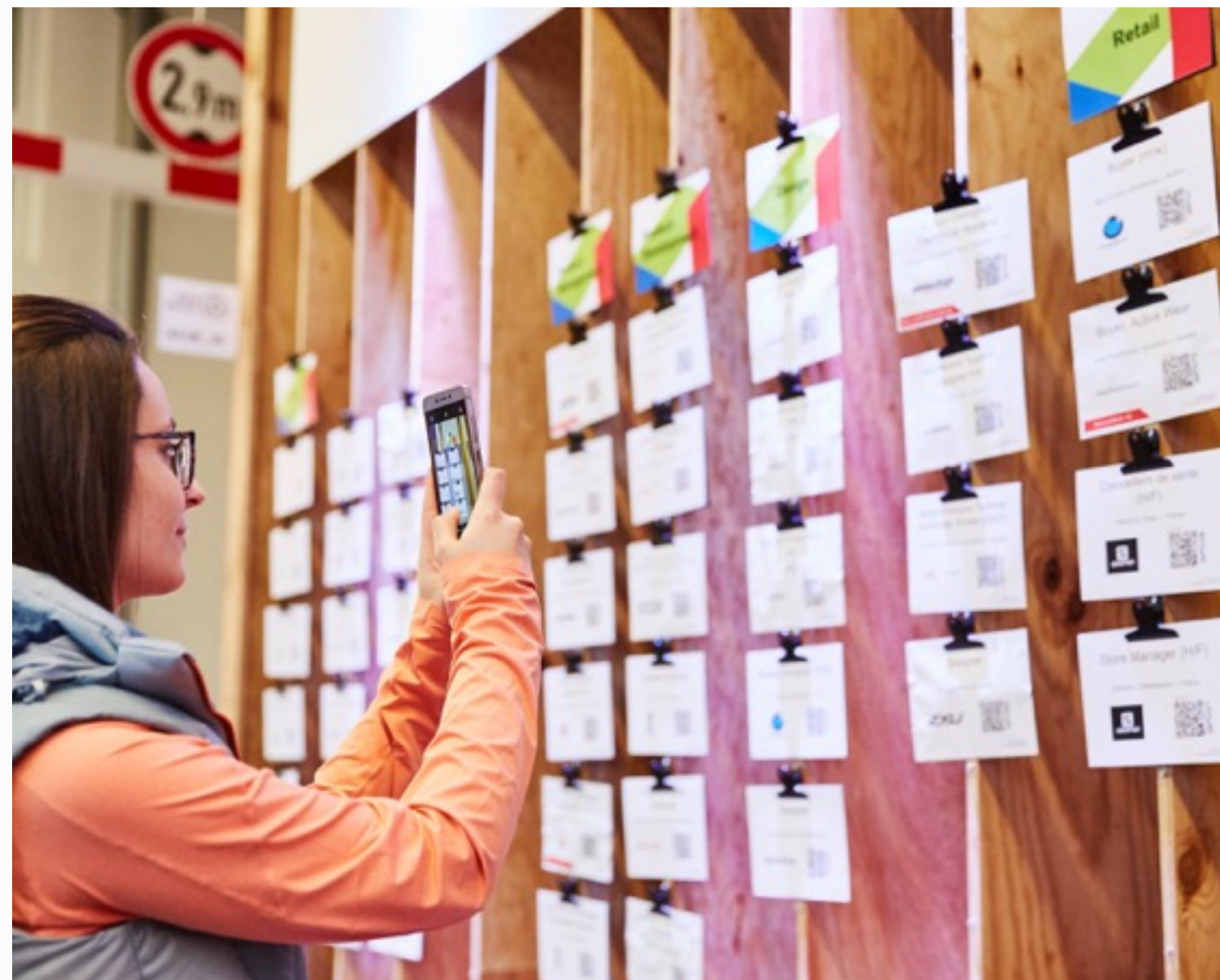
JOB WALL displayed and sorted by departments for easier referral